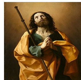
St James' Feast Day is celebrated on the 25th July.